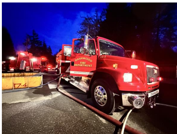
Automatic Mutual Aid Structure Fire